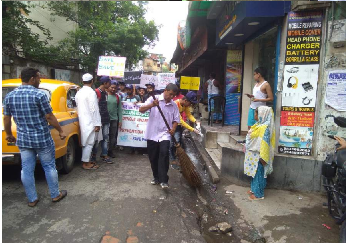
PLATE 20 DURING CAMPAIGNING & CLEANING PROGRAMME AT DIFFERENT PLACES OF KMC WARD NO 52