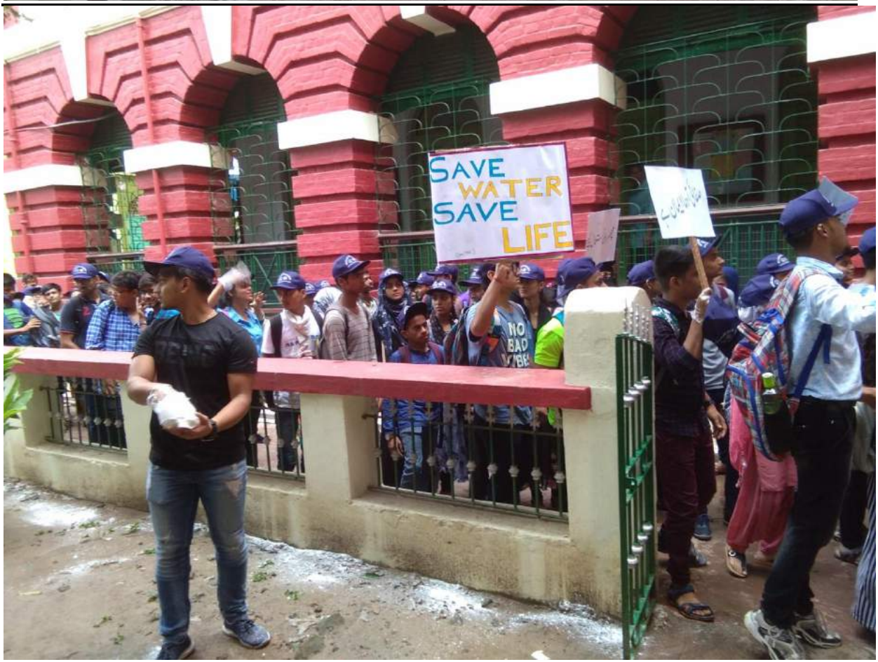
PLATE 16: INSIDE BAKER GOVT HOSTEL PREMISE