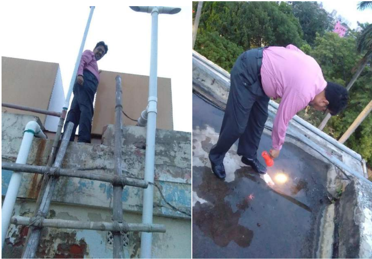
PLATE 8 & 9

DURING INVESTIGATION AND EXAMINATION OF DENGUE AND OTHER VECTOR-BORNE DISEASES LARVAE ON THE ROOF WATER [DUE TO RAIN] BY THE EXPERT