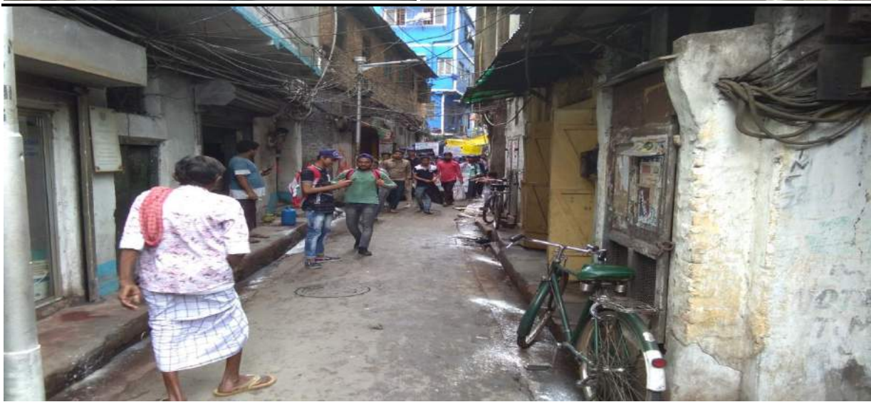
PLATE 18 DURING DENGUE PREVENTION DRIVE CAMPAIGNING, GARBAGE CLEANING & DUSTING BLEACHING NEAR SMITH LANE