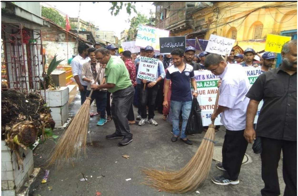
PLATE 17: DURING CLEANING BY THE TEAM IN AND AROUND KMC WARD NO. 52