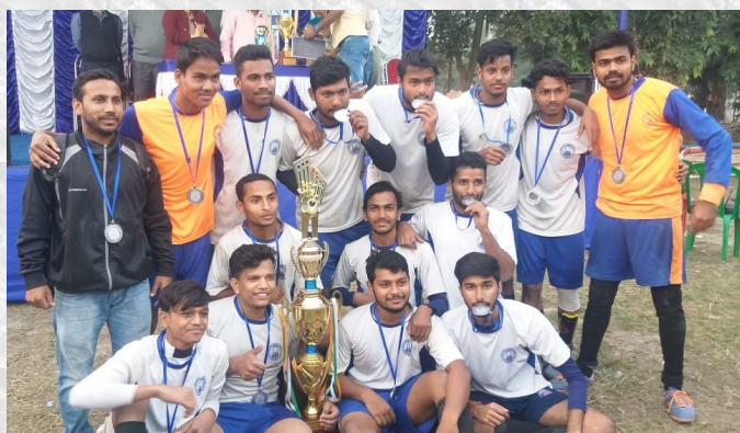
Runner Up- C.U. Inter College Games & Sports Championship 2019-20

The College possesses a big playground at Gorachand Dutta Lane. In addition, the College for large-scale events requisitions the Calcutta University Ground. The Annual sports is held at the beginning of every year. Prizes and trophies are awarded following the meet, to participant students as well as teachers. The students displaying bright prospects for the relevant sport are encouraged and trained to participate in Inter College and Inter University Sports Meet throughout the year. The college team regularly participates in the Inter- Government College and Intra University Football and Cricket Tournament and Athletic Meets.