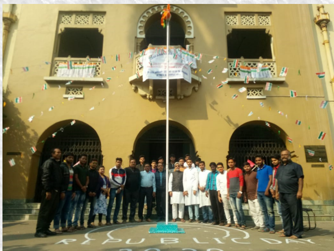
Republic day celebration: 26th January, 2020

The College maintains the tradition of holding debates on special issues, quiz competitions, on-stage plays and the annual “Mushaira” (Kavi Sammelan), which witnesses the participation of renowned poets from the city and beyond. The College also observes ceremonial events like Milad-un Nabi, Saraswati Puja, International Language Day, Tagore Anniversary, World Environment Day and so on, so that the students and teachers can pay respect through their creative abilities and participation. National events like Independence Day, republic day, Netaji’s Birthday etc. are observed with due diligence.