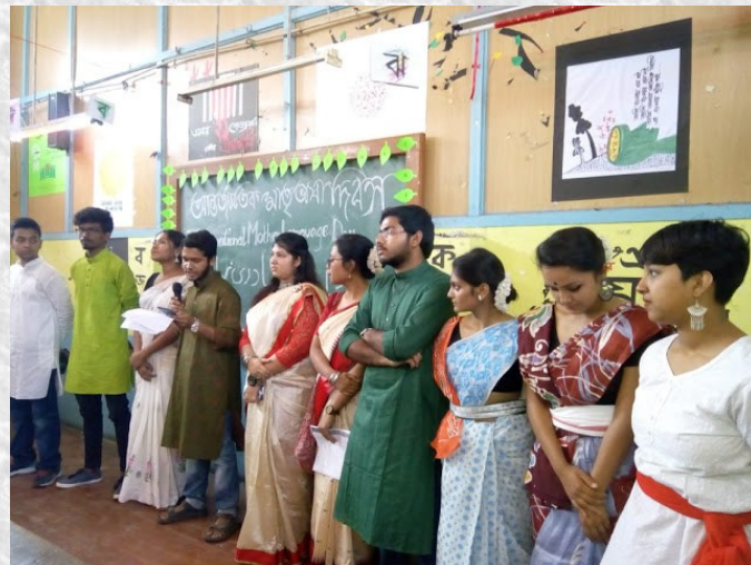
International Mother Language day programme: 21st February, 2020