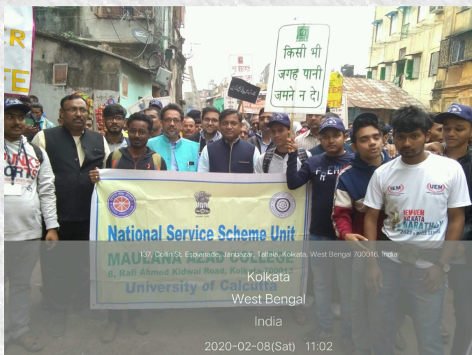
Dengue awareness programme by NSS unit