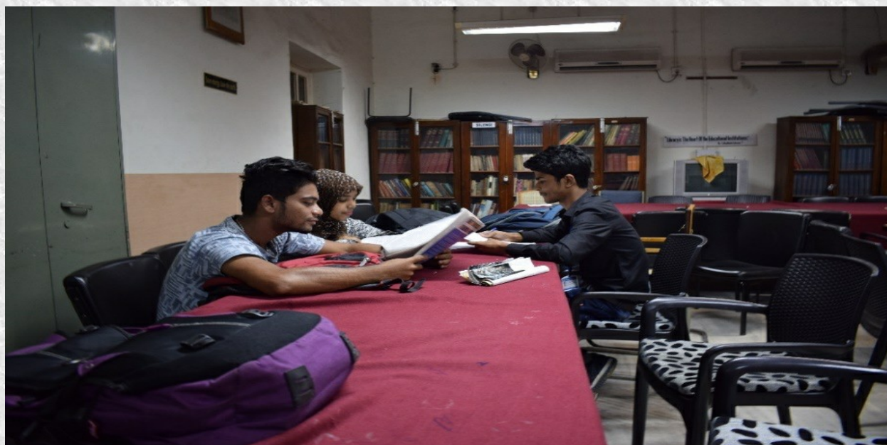
Central library: Reading Room