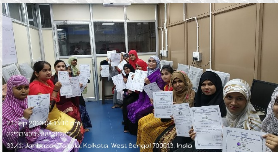
Basic Computer Training Course for Minority Girls-WEBEL-MAC initiative

A Language Laboratory with facilities like, Laptop, Television with Film Screening is available for the students. With six language options in the college, the students seeking to pursue literature, can get involved in different activities in Language lab like the translation projects, the interactive seminars/symposia. For example, completion of a project on translation of selected works of Jnanpeth Awardee poet Bishnu De in as many languages as are taught in this College and a language workshop was organized by the PG Department of Urdu last year.