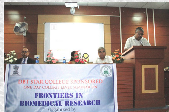
DBT star college programme: Frontiers in Biomedical Research