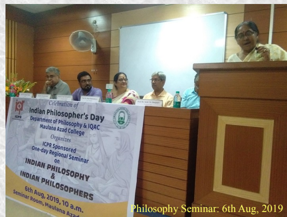
Philosophy Seminar: 6th Aug, 2019

The College pledges to generate awareness among the students and teachers on contemporary issues. In recent times, the College has organized programs to create awareness on subjects such as health, environment, gender sensitization and cultural harmony. Such programs are often conducted under the aegis of the NSS unit, and in collaboration with NGOs.