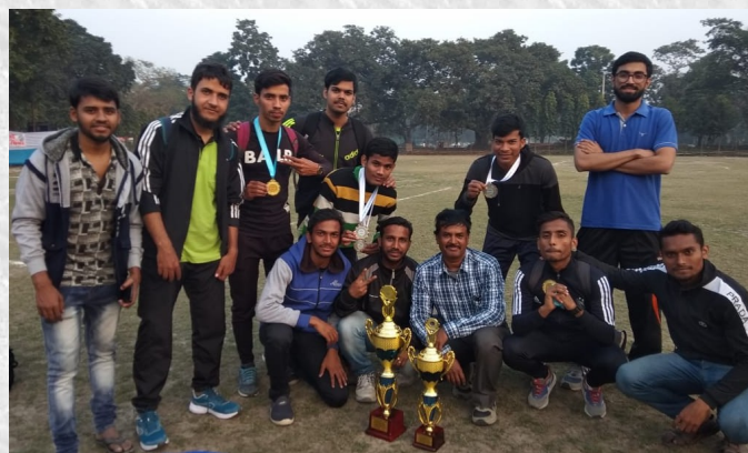
Champion-Inter-College State Athletic Championship 2019-20